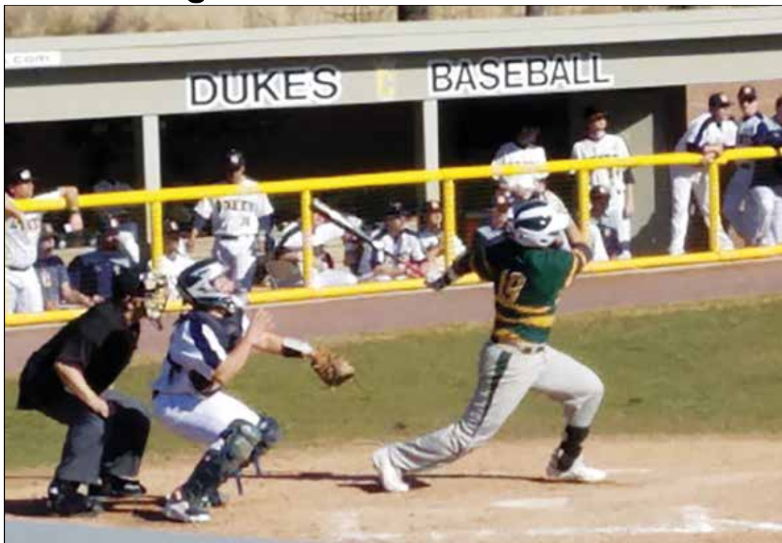
The winning hit as the Vikings took Cumberland 9-6 in the season opener.